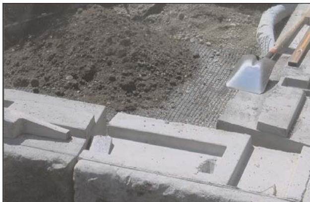
Miragrid® 5XT was placed every 40 cm (16 in) throughout the wall.