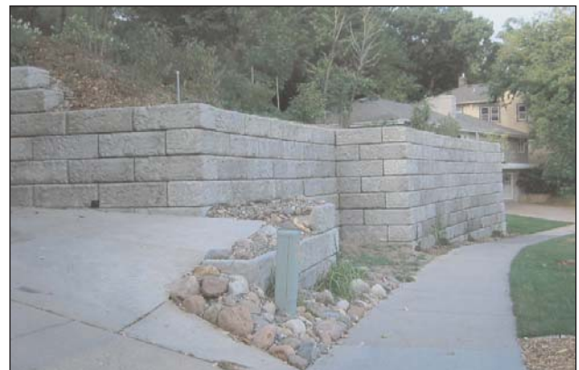
The completed retaining wall eliminated the 1:1 slope 4.6 m (15 ft) from the face of the wall.