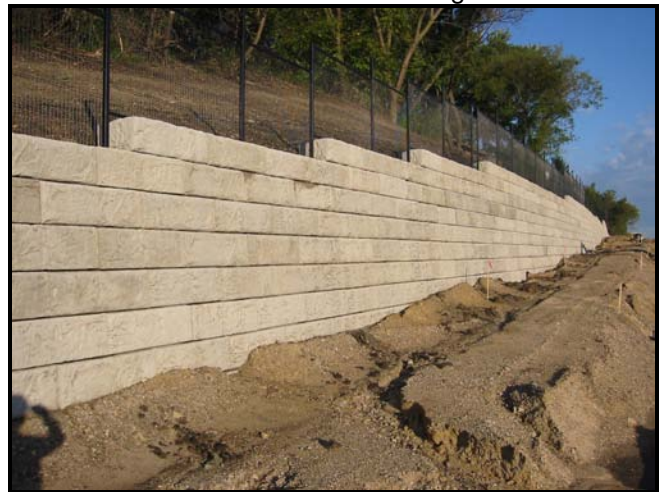
Wall LL taking shape in Rochester, MN.