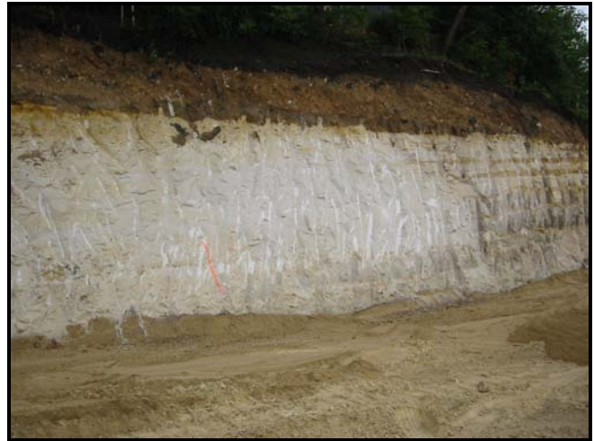
Cut at base of wall revealing bedrock.